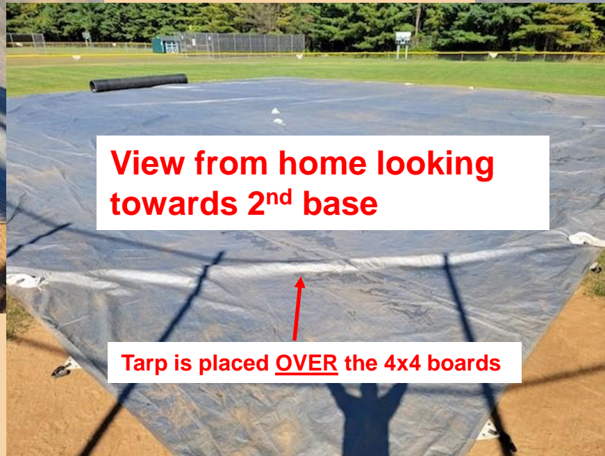
Tarp is placed OVER the 4x4 boards